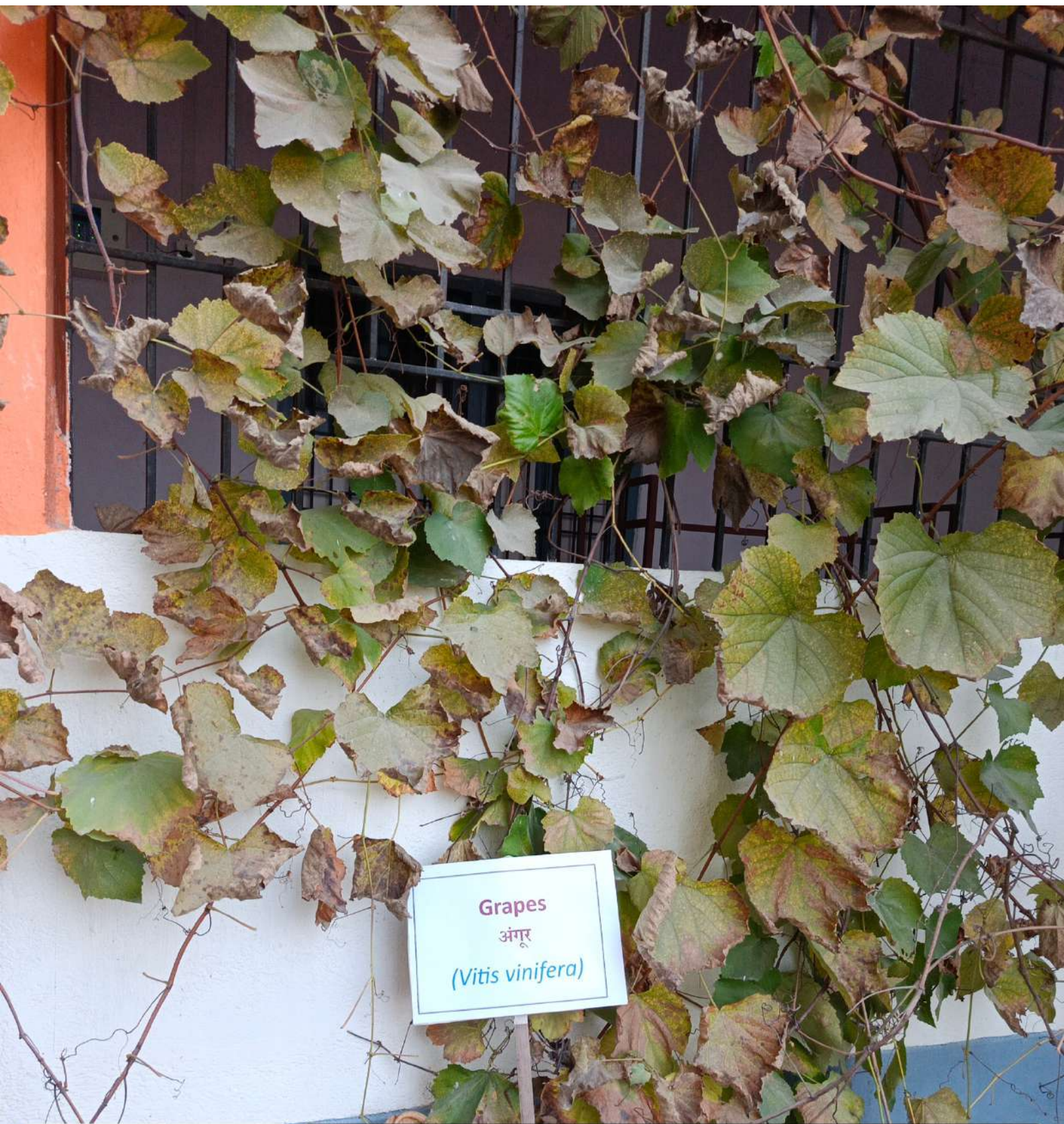
Grapes अंगूर ( Vitis vinifera )